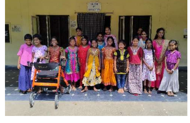
Children at School