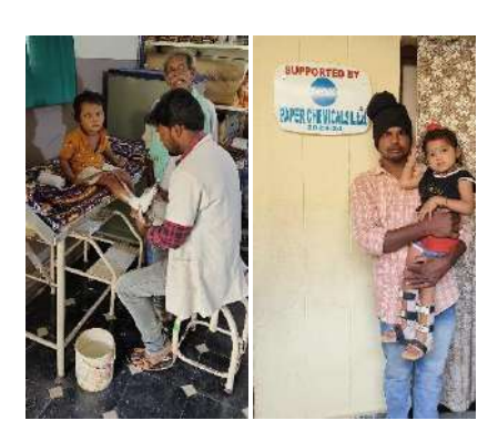
Children attended for fitment camp