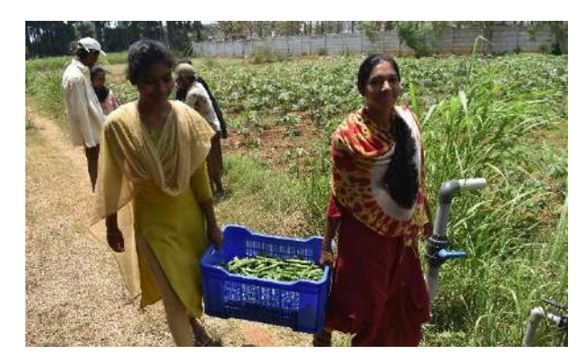
Young children trained in the garden

The horticulture program is nothing but our kitchen garden supplying 70 percent of vegetables and fruits requirements of our kitchen. Total 3.5 acers of land brought to cultivation during the years. The youngsters with disabilities learning the course on nursery management, dairy management and the Organic cultivation.