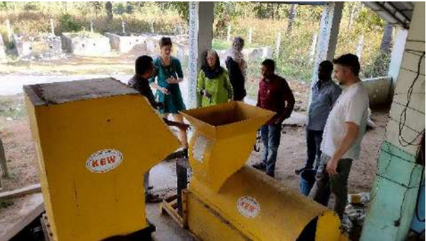
Local Plastic recycling plants visit