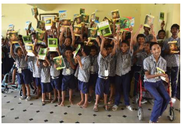
Children at School