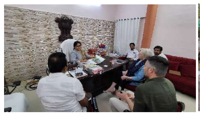
Meet the District collector to find the possibilities