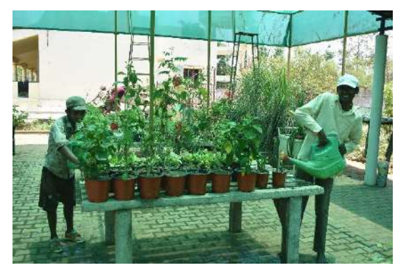
Young children trained in the garden