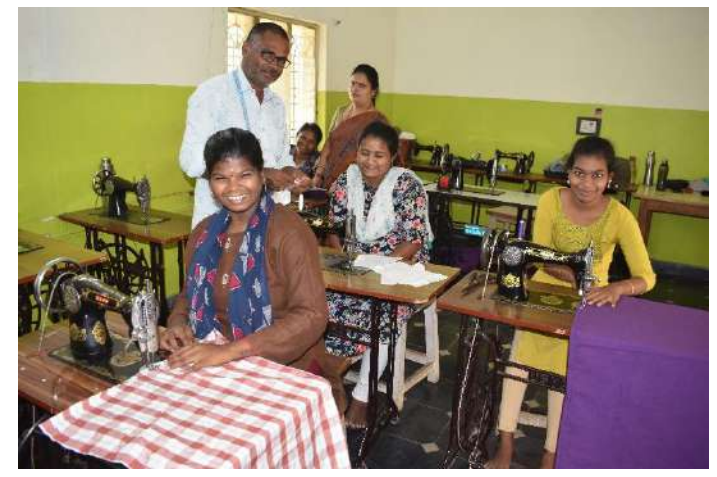
Learning carpentry work

There are many young children who have stopped their education in the middle due to their own limitations. due to the lack of specialized facilities, these children are often unable to access the same level of education as their peers. This is often due to a lack of resources, both in the classroom and at home, to provide the specialized support and accommodations that disabled children need to succeed in school. Additionally, stigma and discrimination can