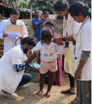
Artificial limbs follow-up visit

Children with special needs in this area now have greater access to Campus Challenge's orthopedic workshop. In response to the good services provided by the orthopedic work, word spread through the mouth and it reached many underprivileged people, allowing everyone access. The number of the clients for the work shop increasing year by year. At present 550 clients were registered. They have a strong follow-up system to keep children confident. They get counselling on their visit, assistance for repairs. This system allows the workshop to keep track of the progress of the children and their needs, providing the necessary support for them to develop their confidence and take away the anxiety.